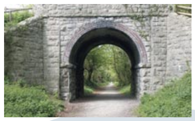
Stone bridge over Dyserth-Prestatyn Walkway.

gate and take steps down to join the Dyserth to Prestatyn Walkway turning right towards Prestatyn. Look out for the low level caves in the limestone rock on the right (grilles fitted to prevent unauthorised entry). Follow walkway until reaching wooden gate and the old railway goods shed (stone building) on the left.