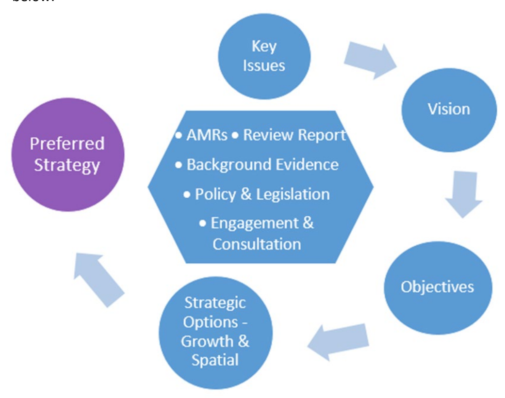
Figure 1.2: Preferred Strategy Process Diagram (adapted from the Welsh Government LDP Manual)

1.8 Section 5 of this report sets out options on the level of development growth in the county described in terms of housing and employment. An indication of the preferred level of growth is provided having undertaken consultation with key stakeholders and Members as well as a Sustainability Appraisal.