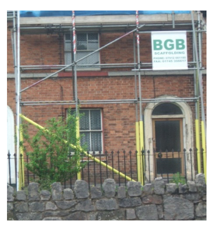
Railway Terrace, Ruthin – before- a two bedroom, mid-terraced, Grade II listed house unoccupied for over 20 years. The property became very damp due to damage to the roof resulting in complaints to the Council from concerned neighbours about the structural integrity of the building.