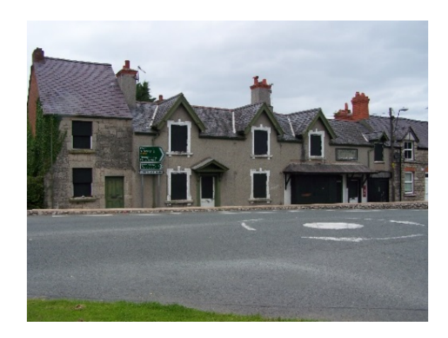
Mwrog Street, Ruthin – before (Derelict row of terraced houses)