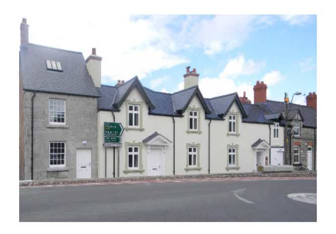
Mwrog Street, Ruthin – after (refurbished into a housing development of 3 dwellings with 2 additional properties)