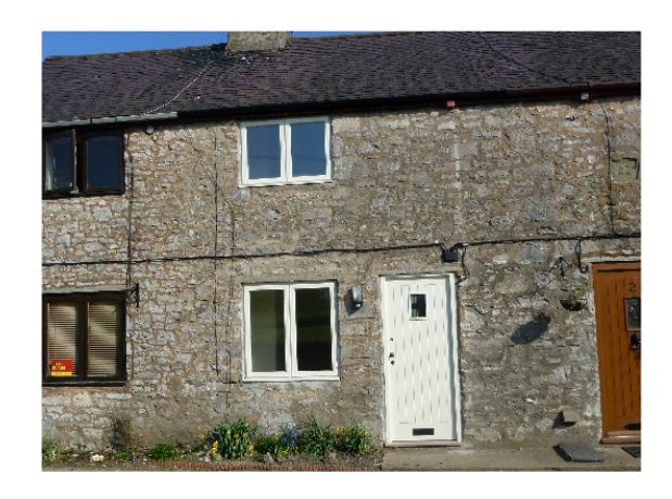
Ty Coch, Henllan - after after tracing the owner who had moved out of the area, extensive negotiations were held with the owner. A large programme of works were drawn up and financing applied for the works to be undertaken. The works included a new kitchen, bathroom, plastering, electrical wiring etc. The property has now been tenanted and is providing affordable housing for a local family.