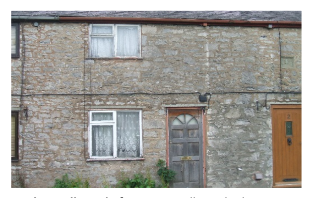
Ty Coch, Henllan – before – a small two bedroom cottage which had been unoccupied for several years. The owner abandoned the property leaving it full of food which encouraged a pest control problem and it was still full of belongings.